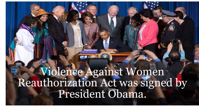
Violence Against Women Reauthorization Act was signed by President Obama.

What are VAWA Crimes? The Violence Against Women Act crime statistics are included in the Clery Reportable Crimes. These crimes include: