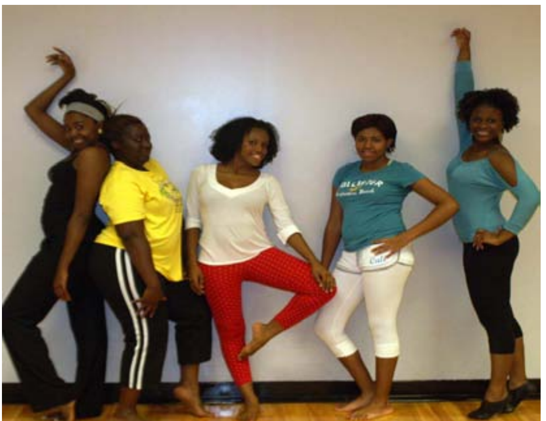
Dance Club members