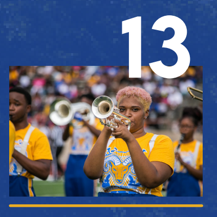
KEY PERFORMANCE INDICATORS