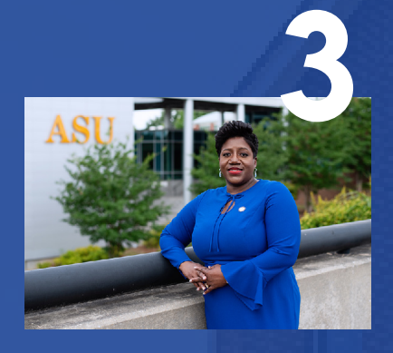
MESSAGE FROM THE PRESIDENT