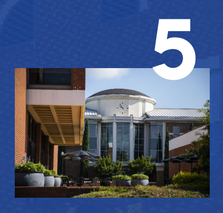
ABOUT ALBANY STATE UNIVERSITY